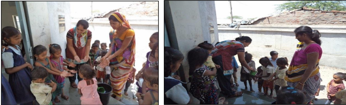
Fig. Preaching the benefits associated with washing hands frequently

This has directly benefitted 4000 students spread across all 11 schools and 13 Aanganwadis .